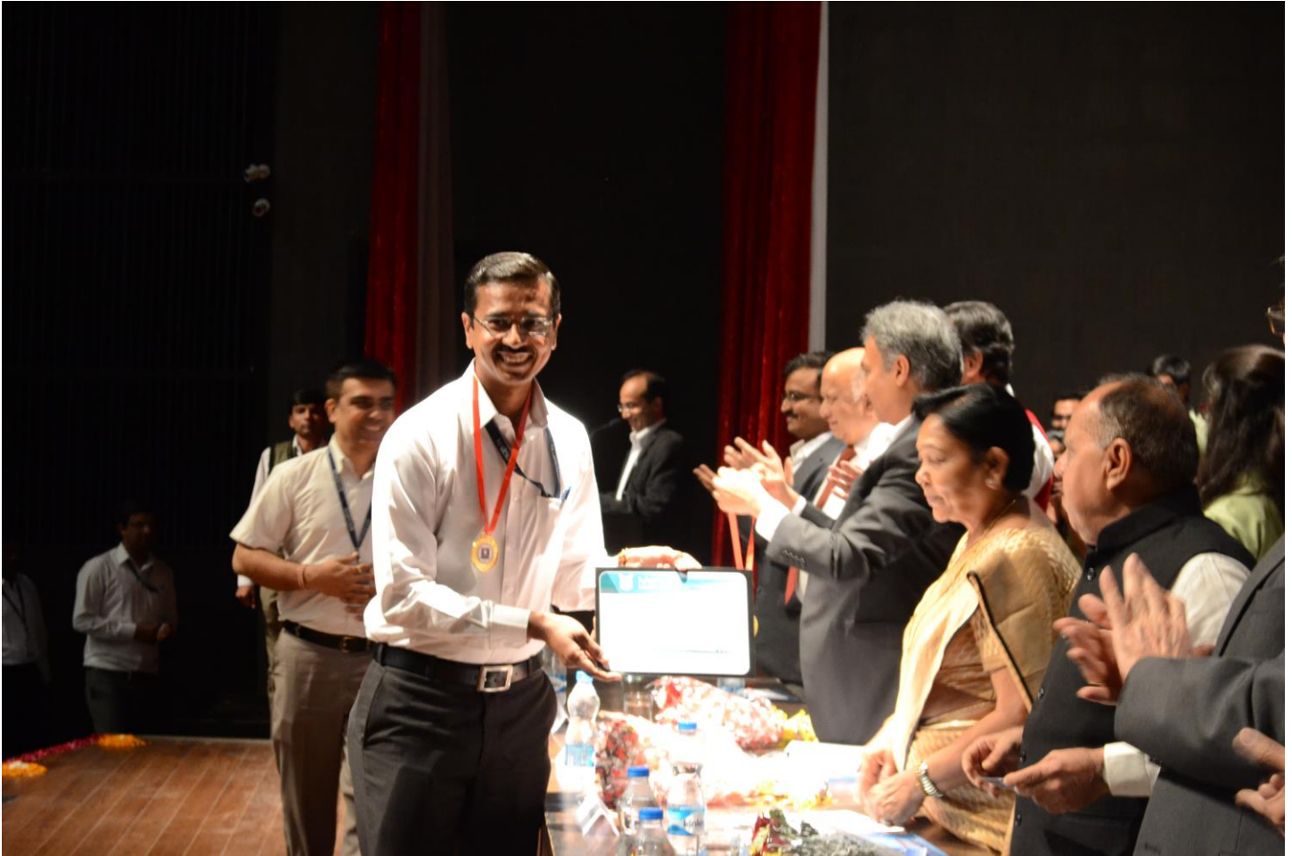
Glimpses of felicitation ceremony