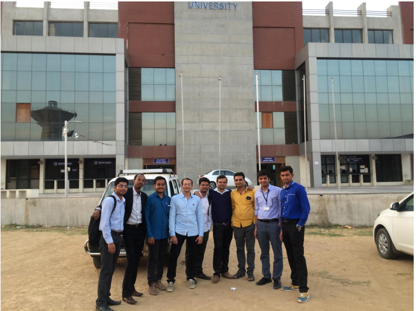
A glimpses of Marwadi students standing in front of GTU, Chandkheda

Students of Post-Graduation study, went to GTU, Chandkheda for dissertation work.