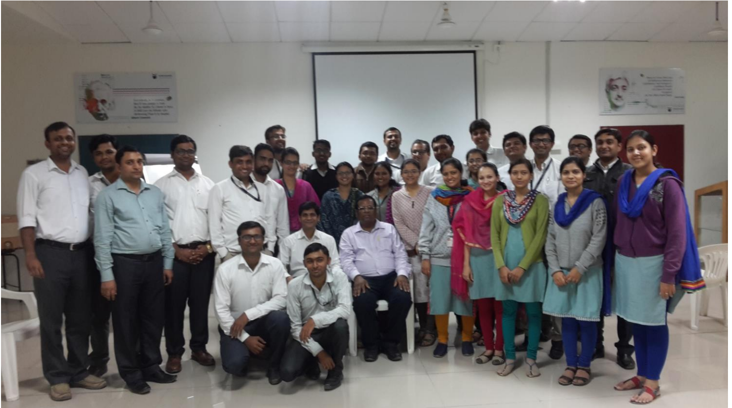
Glimpses of faculty members participated in WIPRO 10X Engineering FDP

Faculty development program was conducted by WIPRO in order to brush up the teaching skills, sessions include innovative ideas and skills of teaching, so that one can easily communicate with students and can deliver best of what they have. This program helps faculty to break iceberg and solitude with students which helps them to reduce communication gap with student. Faculties of civil engineering department actively participated in this development program.