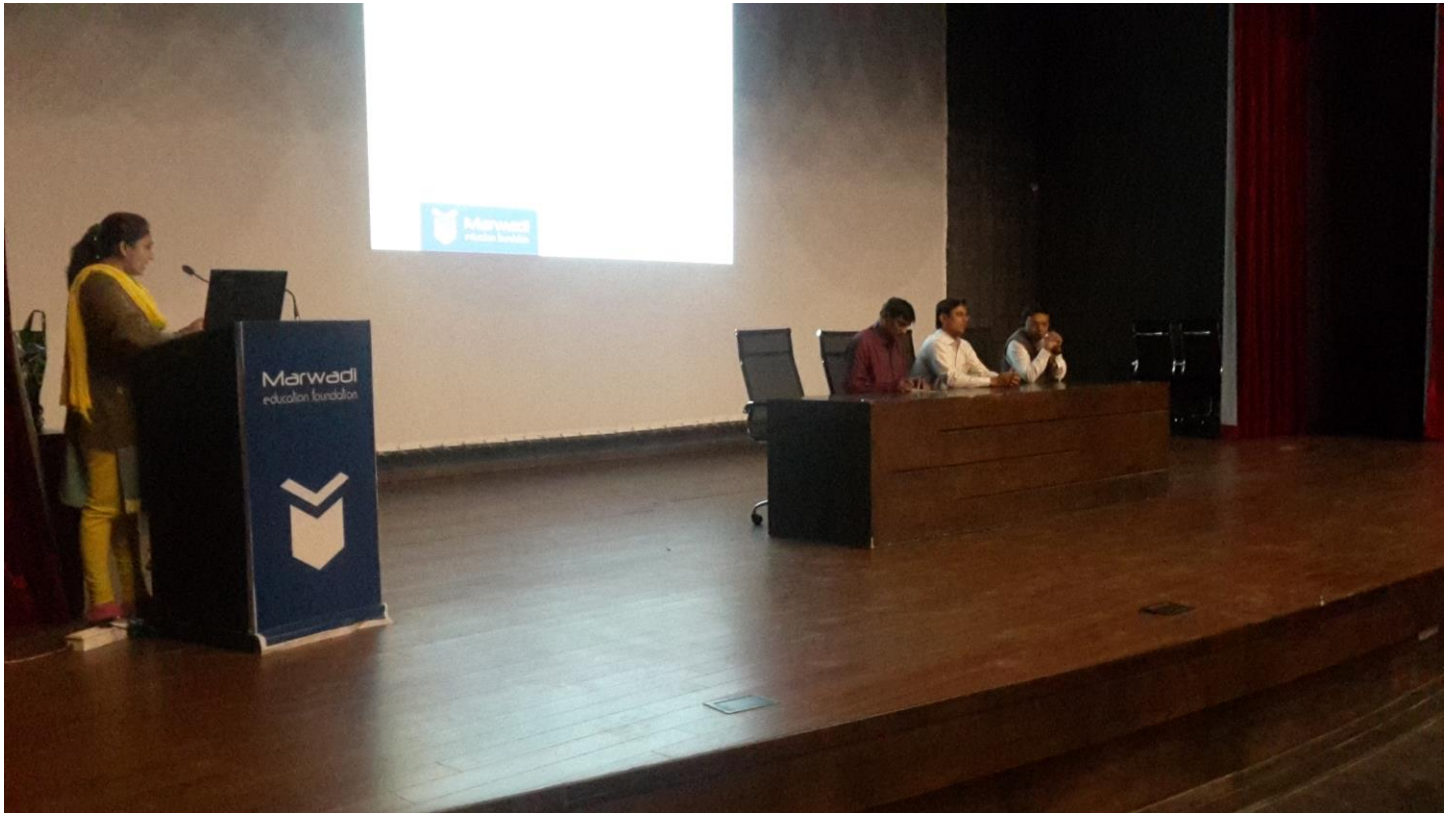
Photograph of ongoing seminar