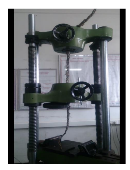
Fig.-2 Making and testing of tesnile member