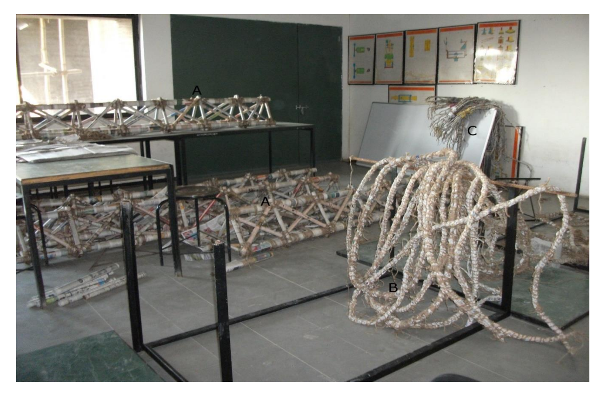
Fig.-4 A) Piers with bracings; B) Supporting cables; C) Bracings