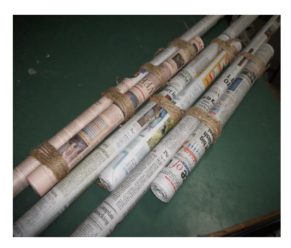
Fig.-6 Components and Connection of deck

In deck, arch is important to transfer the load to the piers. That's why it has to be strong so in that instead of using paper cable, cotton rope of 35mm diameter is used for making arch.