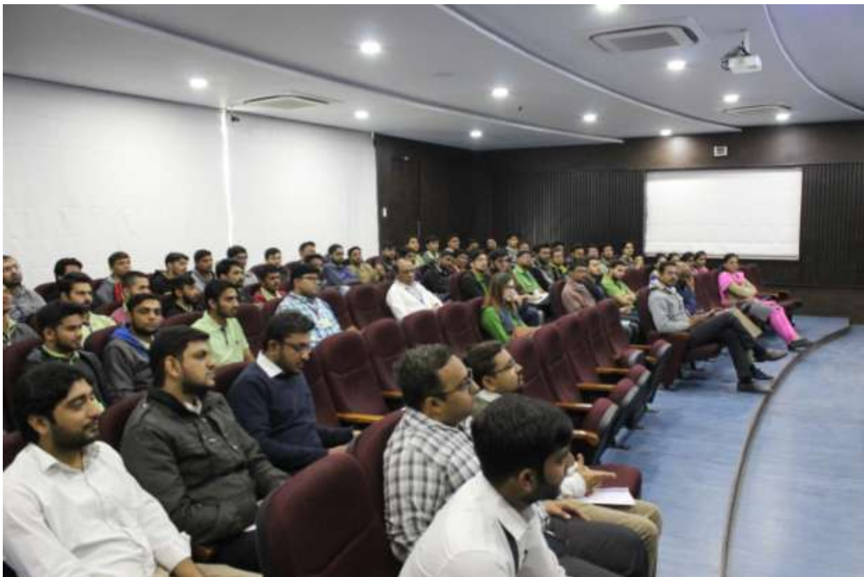
AUDINACE: OUT SIDE PARTICIPANTS, FACULTIES OF MEFGI, PG STUDENTS OF 'ME-STRUCTURE'.

All the technical sessions were delivered then after as per the schedule by experts from relevant fields.