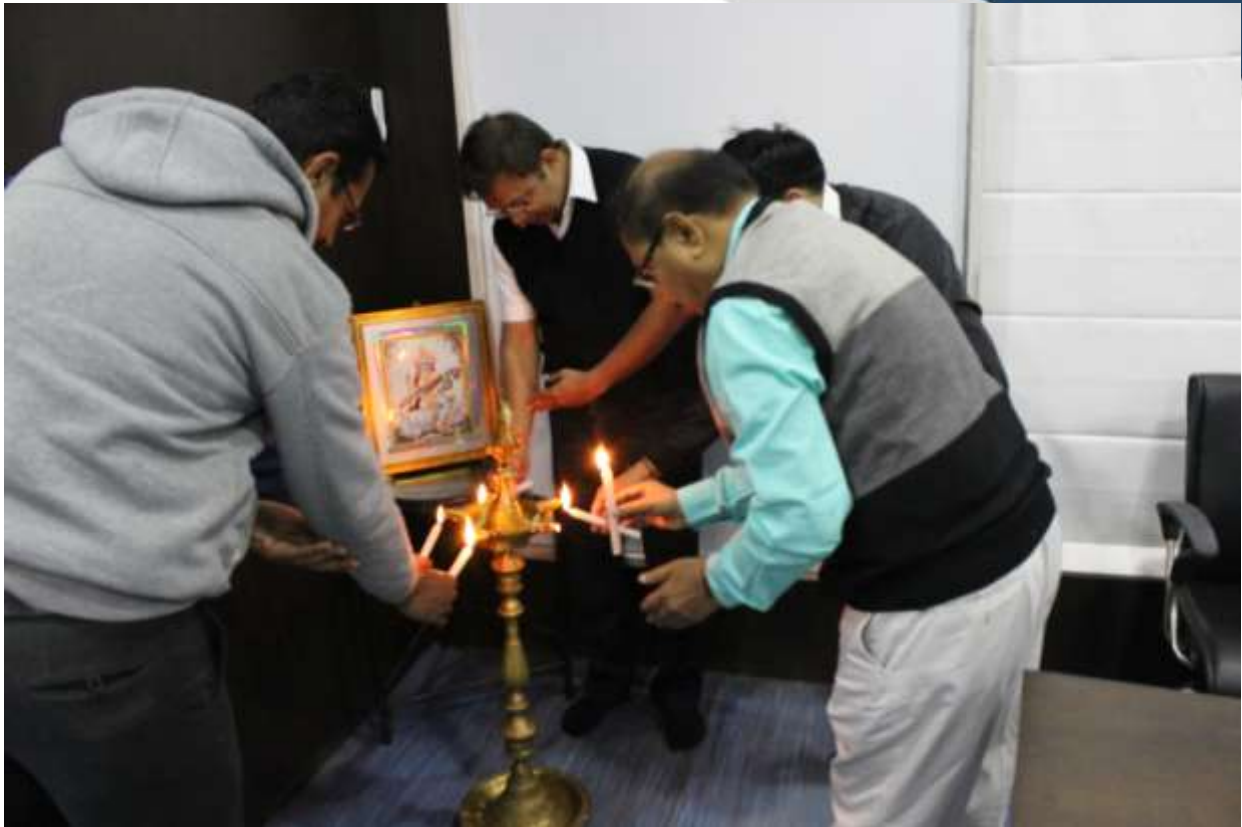
LIGHTENING OF LAMP & PRAYER